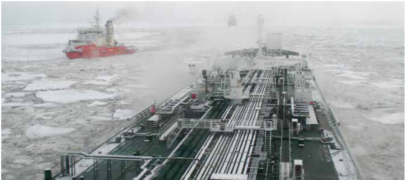
Arctic: Varanday field.