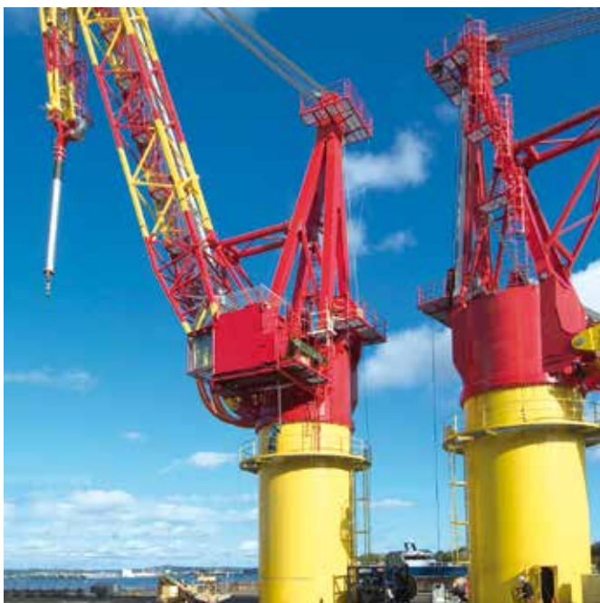
Arctic: MacGregor arctic loading cranes for Priazlomnoye field, Russia.