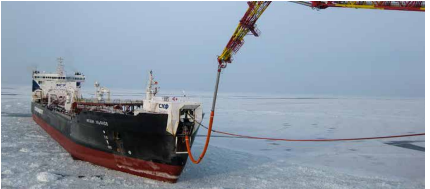
Loading at Priazlomnoye field, Russia.