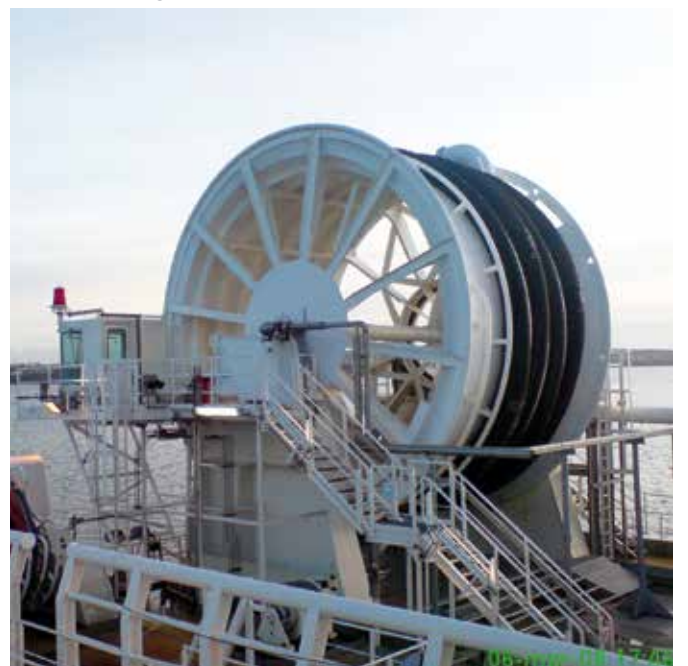
Offloading: MacGregor offloading hose reel on board Alveim FPSO.