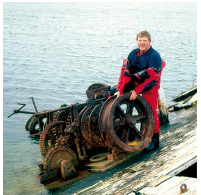
Reference: MacGregor anchor winch on board the wreck of MAUD , Northern Canada.