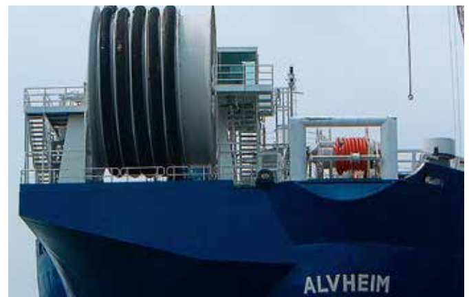
Offloading: MacGregor offloading system on board Alvheim.