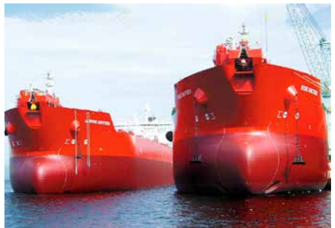
Knutsen shuttle tankers Jasmine and Rose .