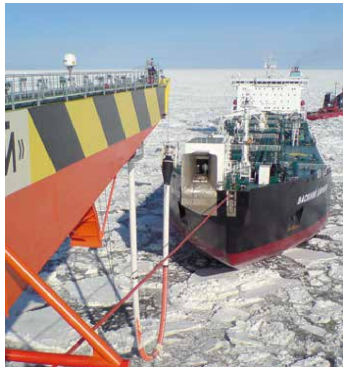
Varandey field, Russia: First offloading with MacGregor bow loading system and MacGregor offloading system in June 2008.

Some of the first references for the supply of MacGregor deck winches are for the polar vessels Fram and Maud, used by Roald Amundsen during his polar expeditions in the early 1900s (including his historic expedition to the South Pole in 1910-1912).