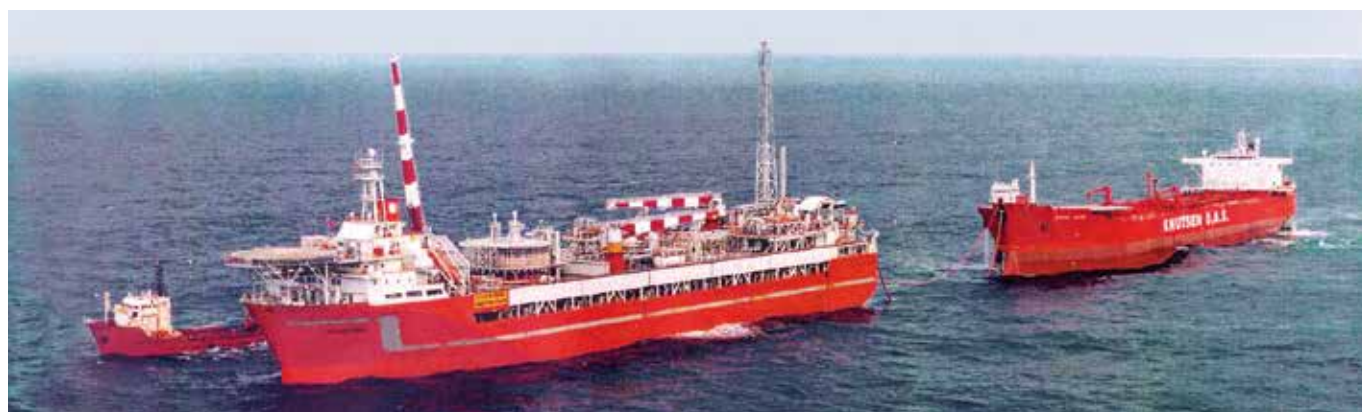
Ragnhild Knutsen loading from the Varg FPSO.