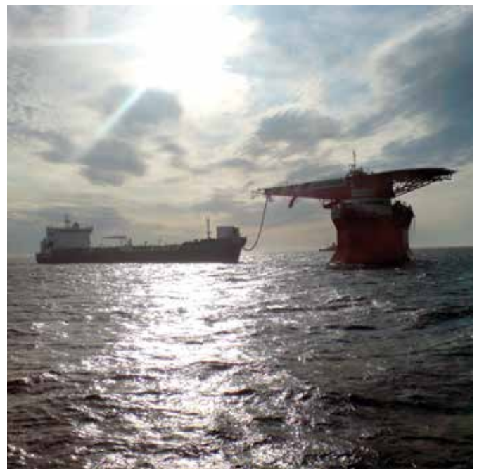
Offshore loading at the Varandey field in the Barents Sea.