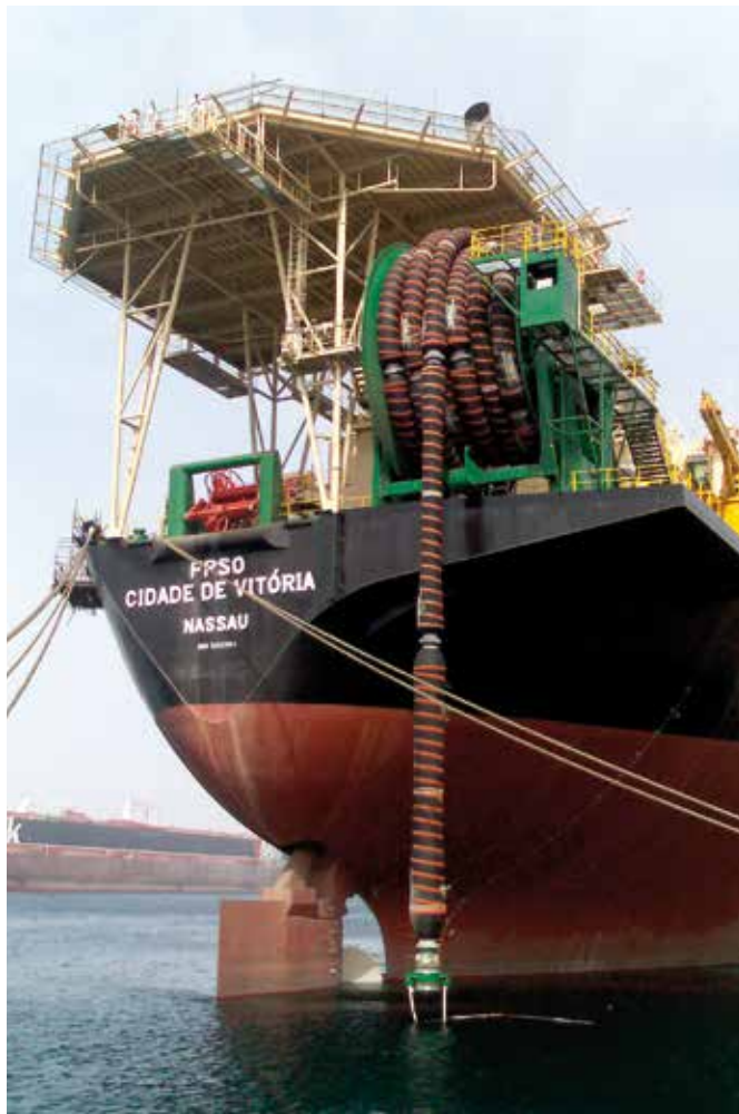
Offloading: MacGregor offloading system on board FPSO Cidade De Vitória.

All operations are handled without any manual handling of shackles and hawsers.