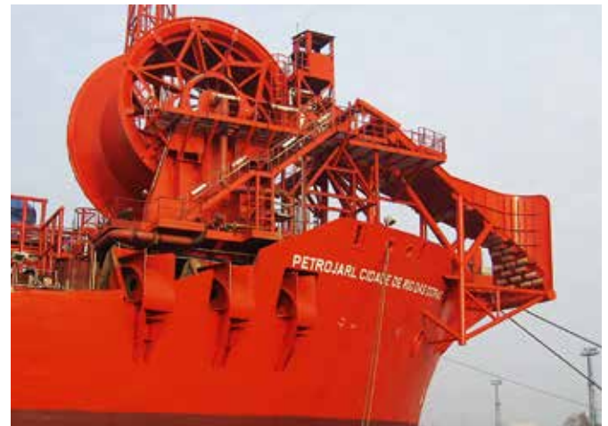
Offloading: MacGregor offloading system on board Petrojarl Cidade De Rio Das Ostras.