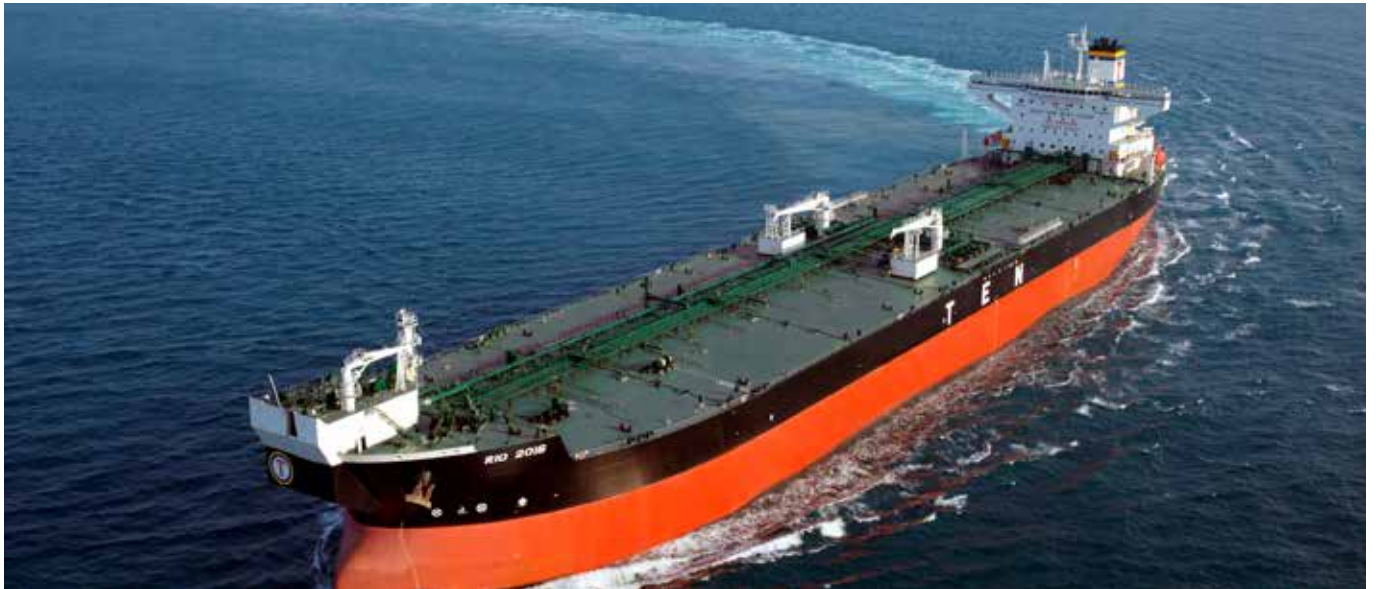
Shipowner Tsakos' shuttle tanker Rio 2016 .