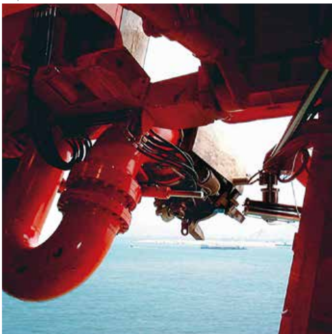
Bow loading, MacGregor cardang suspension with coupler.