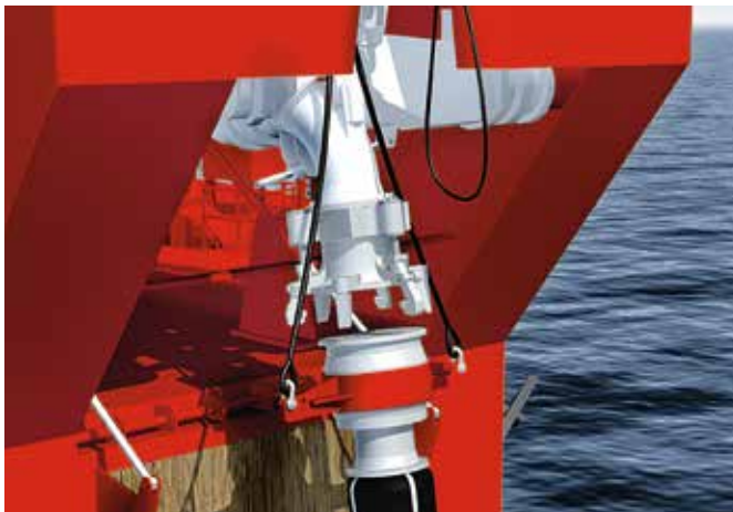
MacGregor bow loading system, coupler.

A roller fairlead and a chain stopper located on the platform deck are operated together with a twin drum traction winch for mooring purposes during tandem loading. The chain stopper is a hydraulically operated, self-locking type, and can be released under full design load. Aft of the chain stopper is a guide roller with a built-in load cell which operates together with a traction winch. The system also includes a storage reel or bin for storing the messenger line during loading.