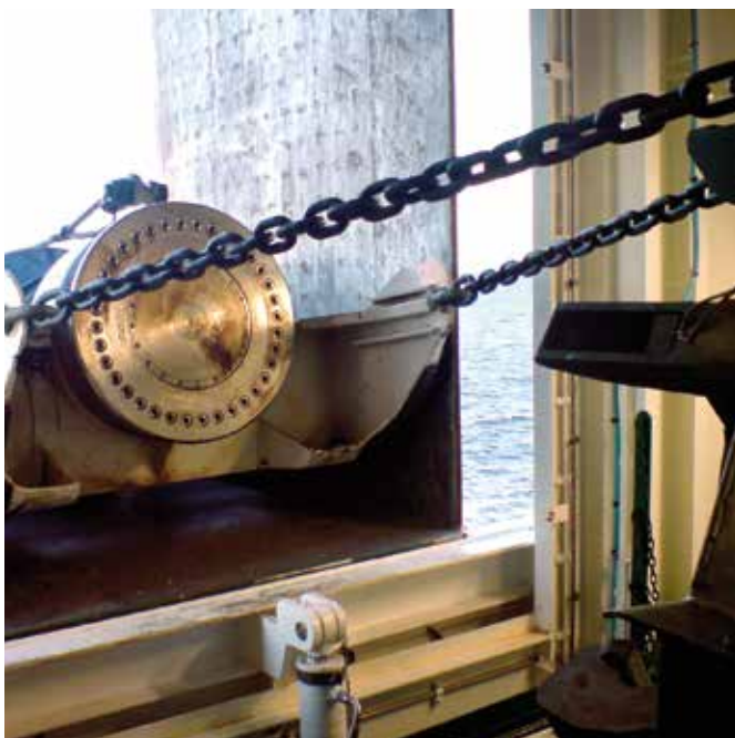
MacGregor bow loading, hose valve on board shuttle tanker Vasily Dinkov .